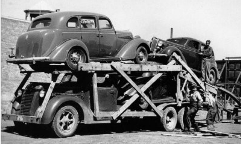
Get 'em unloaded boys!