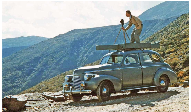
Now move a little to the left.....