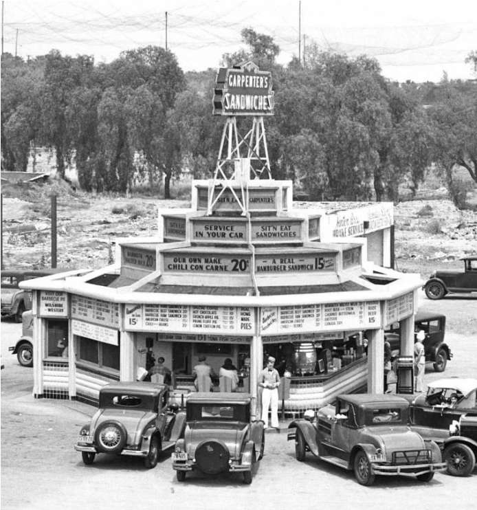
Carpenters Drive-in—circa 1932