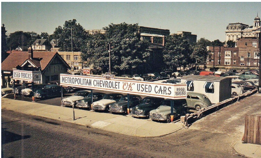
Metropolitan Chevrolet circa 1951