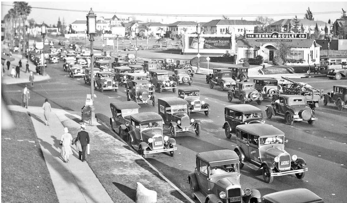
Rush hour traffic on Wilshire Blvd in L A circa 1930's