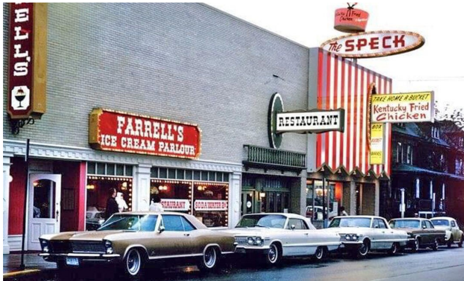
Remember Farrells Ice Cream Parlor?