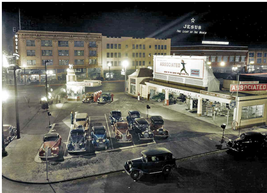
Gas Station circa 1938