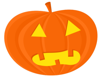
Halloween postcard from 1908