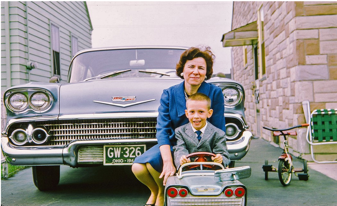
Ready to go for Thanksgiving—1958