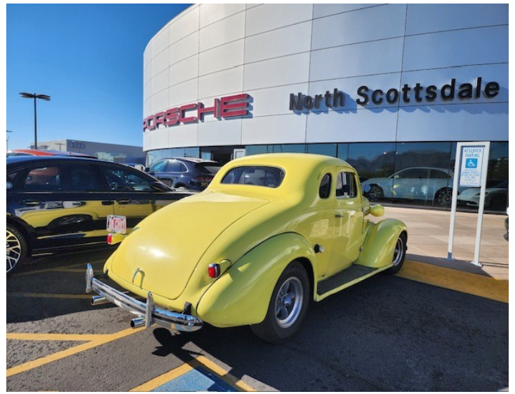
On the way in to eat lunch