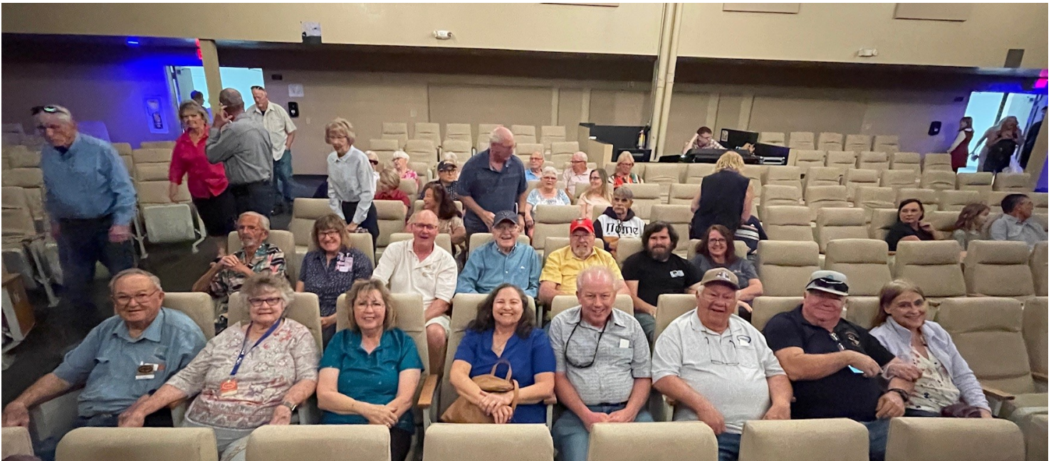
CAR members at Dutton's Family Theater